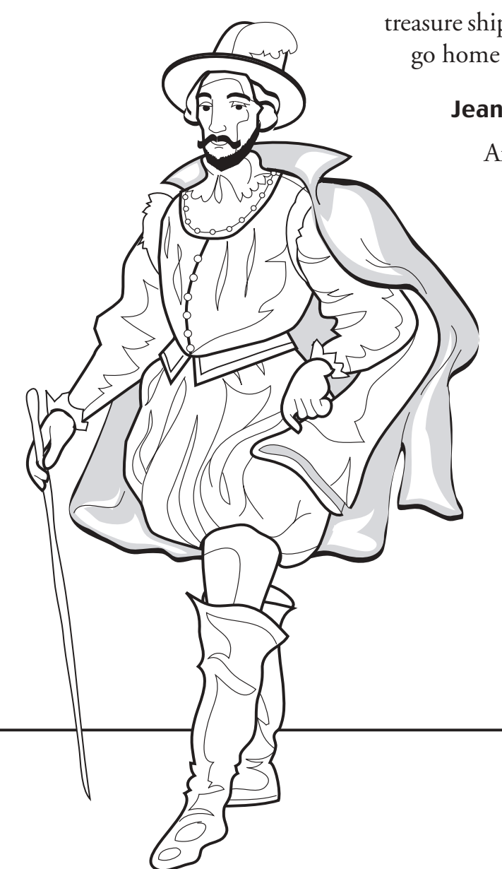
Laudonniere brought over 300 French Huguenot colonists to Florida.

No further French settlements were established in Florida.