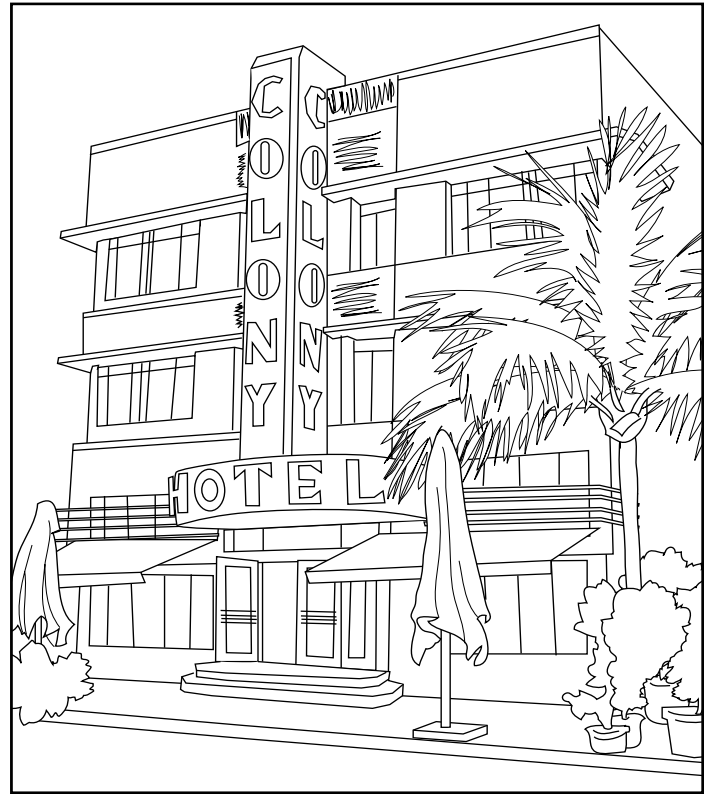
Miami Beach is famous for its Art Deco buildings.

Today, tourism is the most important factor driving Florida's economy. About forty million people visit Florida yearly. The money visitors spend in Florida supports many businesses. Amounting to over $40 billion dollars each year, tourism is the state's greatest source of income. As tourism continues to grow, so will Florida.