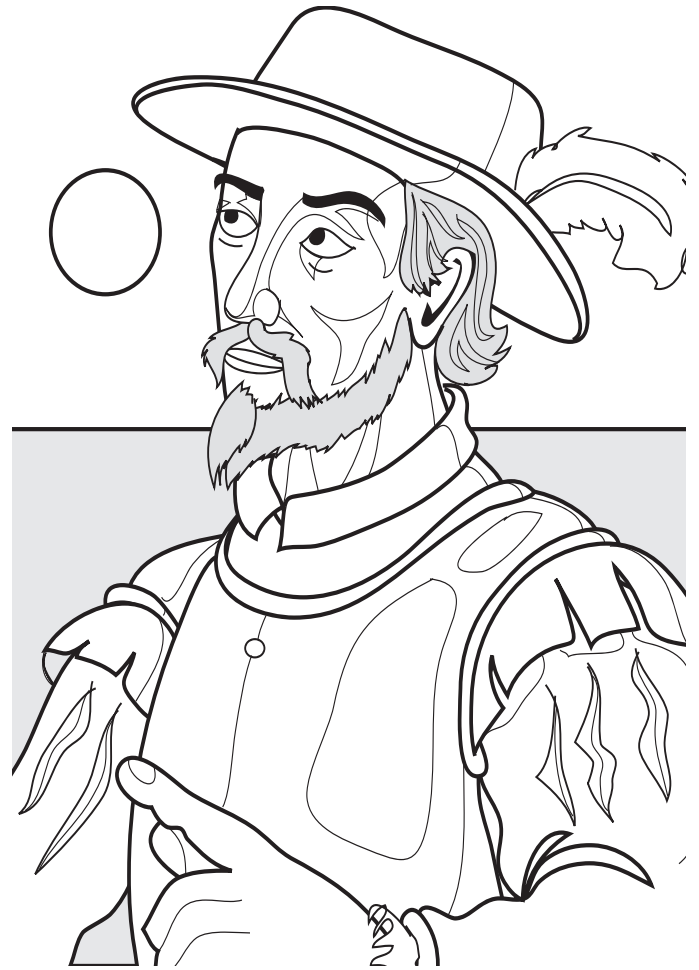
Ponce de León claimed Florida for Spain.

In late March of 1513, his ships landed on Florida's east coast near present-day St. Augustine. He claimed this beautiful land for Spain. Since he had discovered this country of lavish landscape and beautiful beaches, he was entitled to name it. He named it La Florida (LAH flow REE dah) or “place of flowers.”