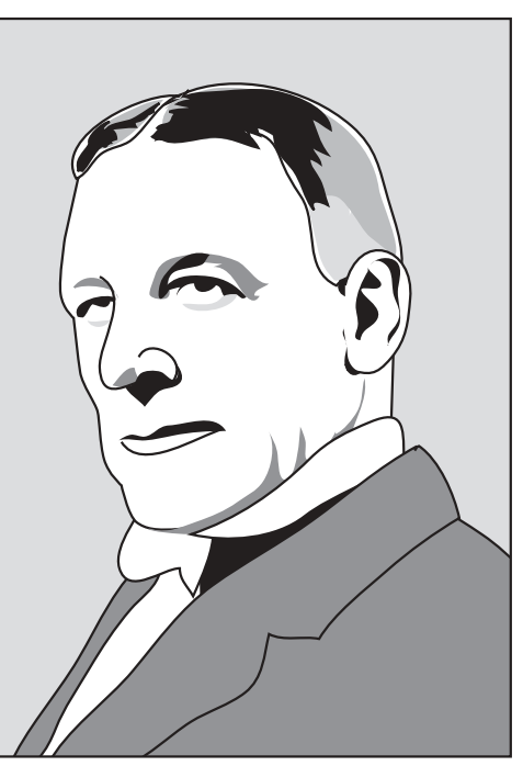
Edward W. Bok

*Taj Mahal: a building in India; considered one of the most beautiful in the world