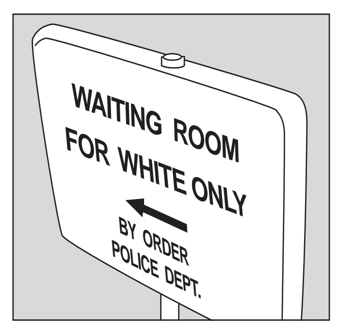
Black Americans were denied access to many public places.

Although it was to take much longer to integrate all Americans economically and fully into society, the official period of reconstruction was over.