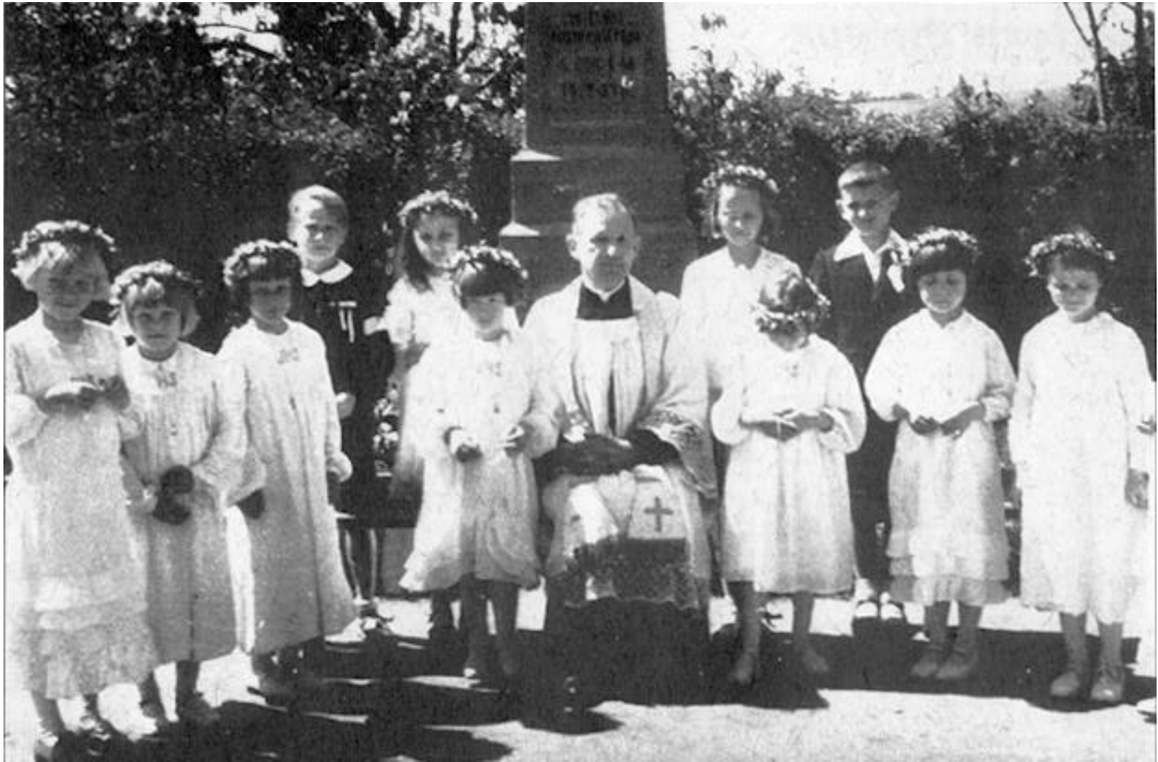
A Jewish child in hiding stands among a group of Polish children dressed up for their First Communion.