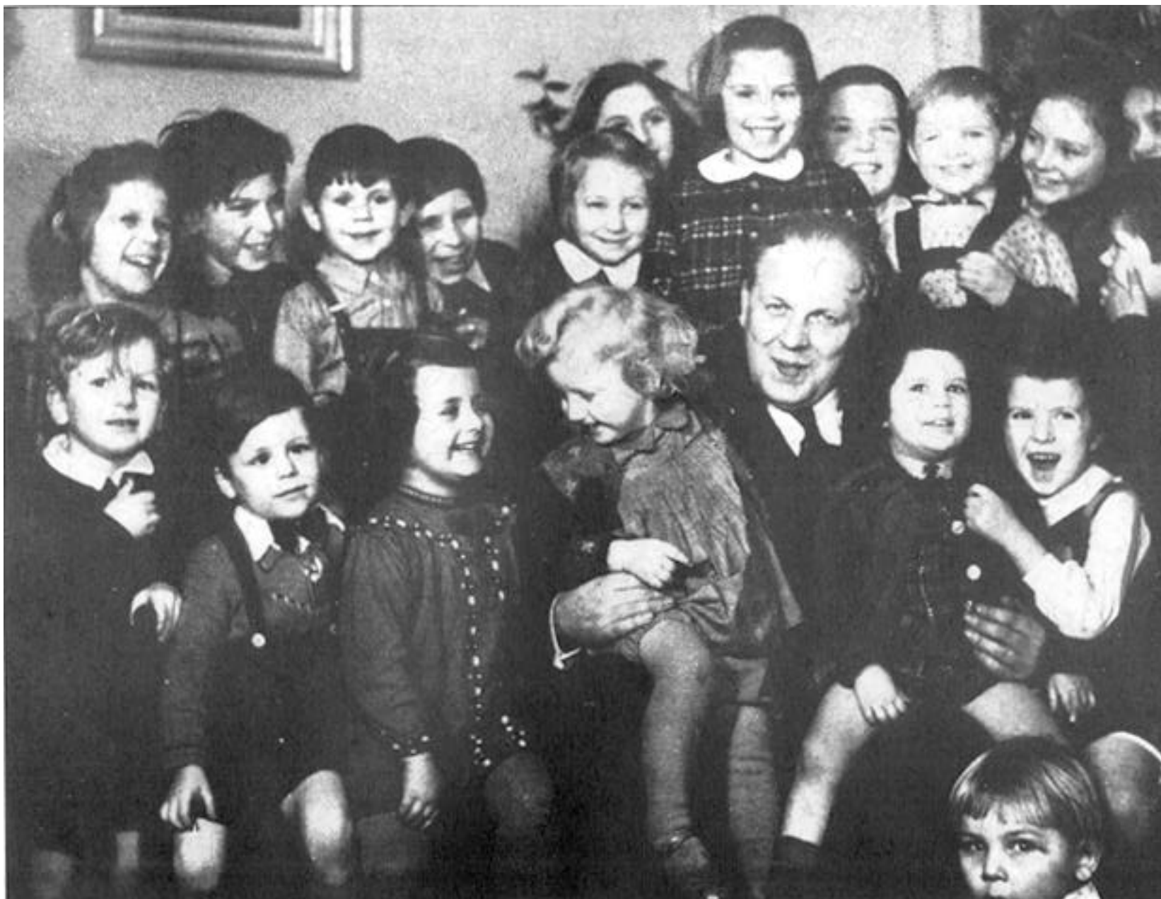
Group portrait of Danish-Jewish children living in a Swedish children's home, after their escape from Denmark.