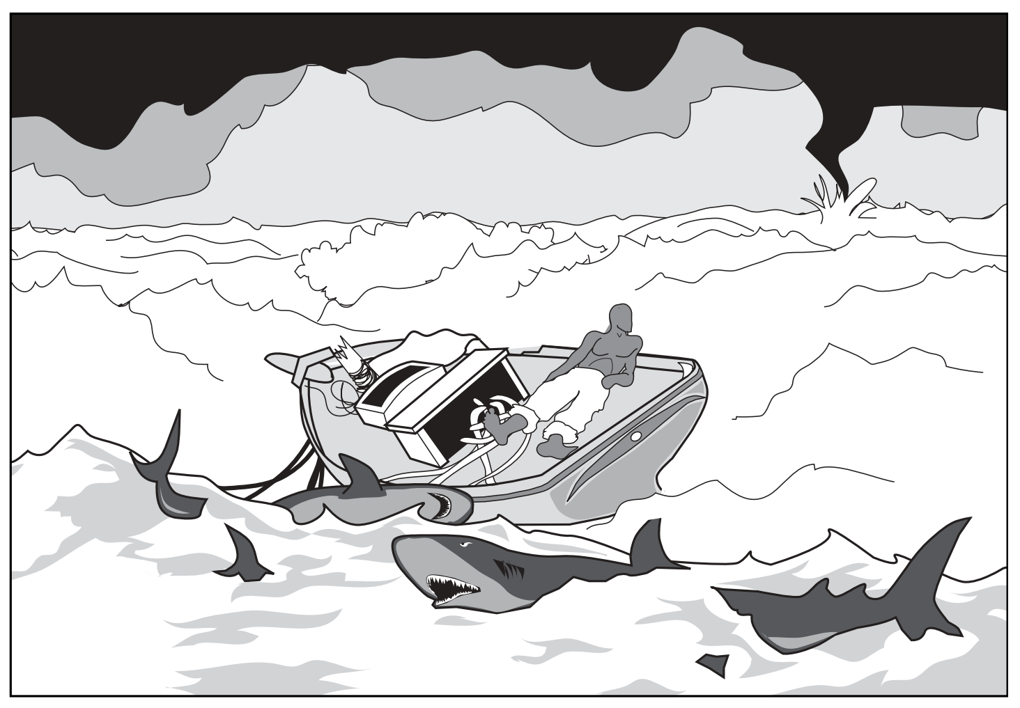
The Gulf Stream, 1899

Homer once remarked, "You will see, in the future I will live by my watercolors." Today, 150 years later, this appears to be true. Winslow Homer is now considered a master of watercolors and one of the great painters of the sea. A naturalist painter, he is often considered one of the greatest American artists of his time. He made a significant contribution to the works of art that have recorded the beauty of Florida.