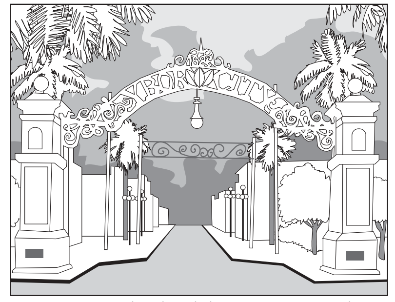
Ornate wrought iron is a distinct feature of Ybor City.

Ybor City is one of three historic Landmark Districts in the state of Florida. The city's past is still very much a part of the present.